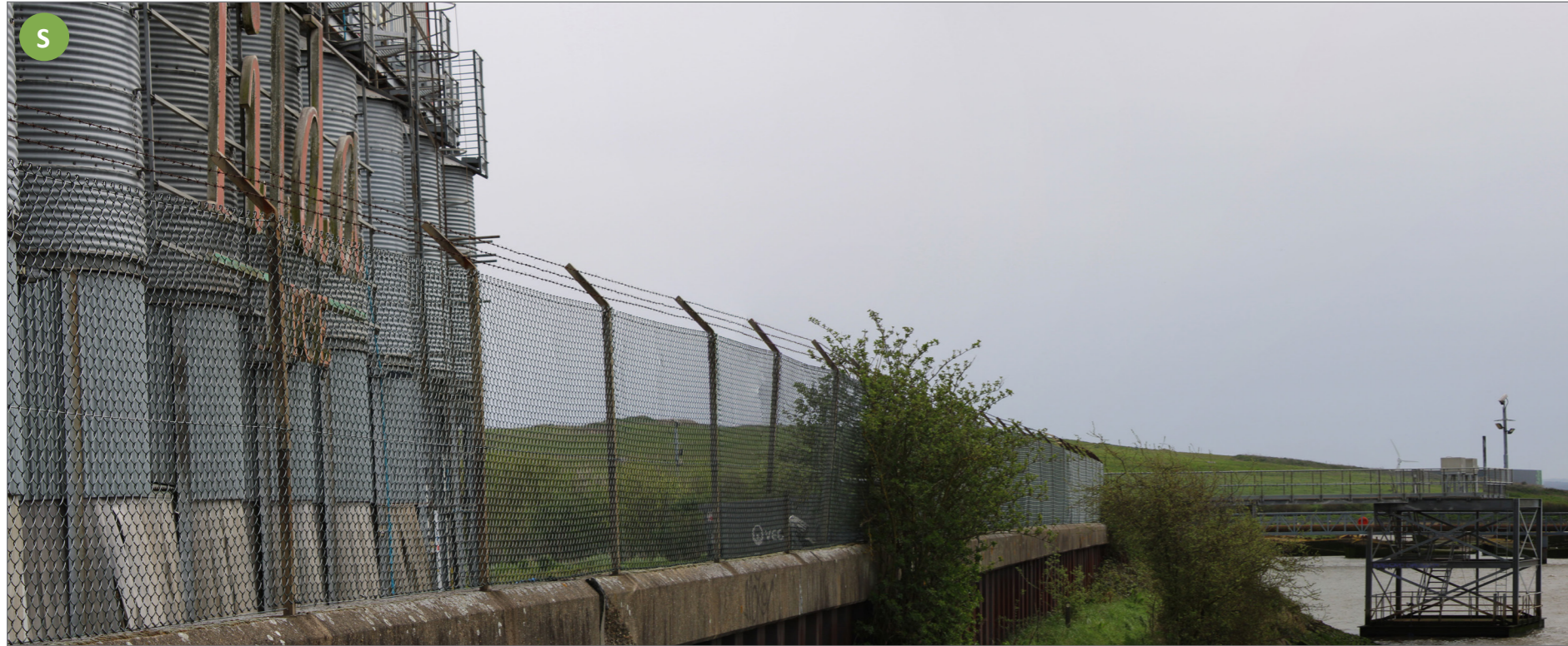
Large scale individual built form structures, with tall security fencing adjacent to the River Thames.

The Character and Appearance of the Local Area