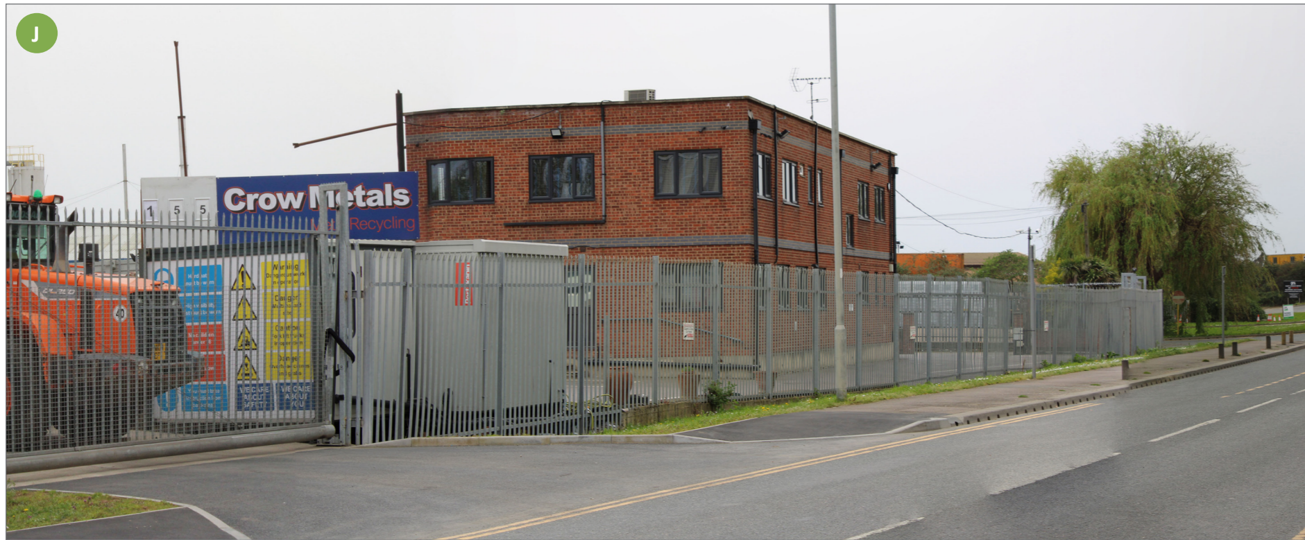
Older employment land with mix of built forms, styles and construction materials - no uniformity.

Frog Island: The Character of the Local Area