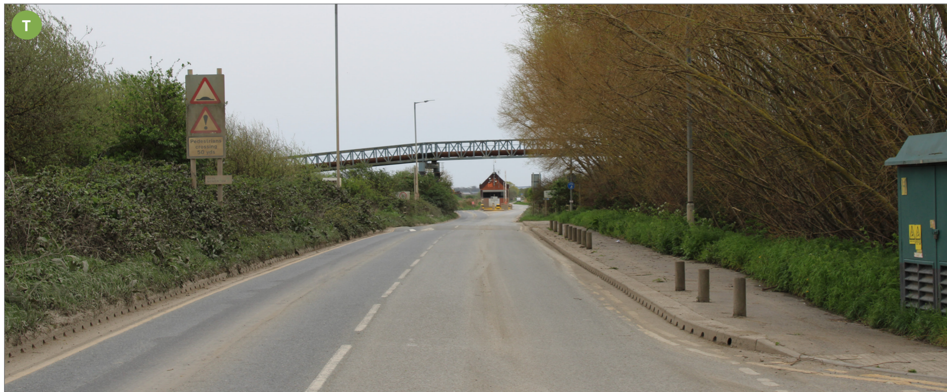
Green corridor adjacent to Coldharbour Lane, with current and previous landfill operations / land disturbance. Individual style of conveyor bridge over road,