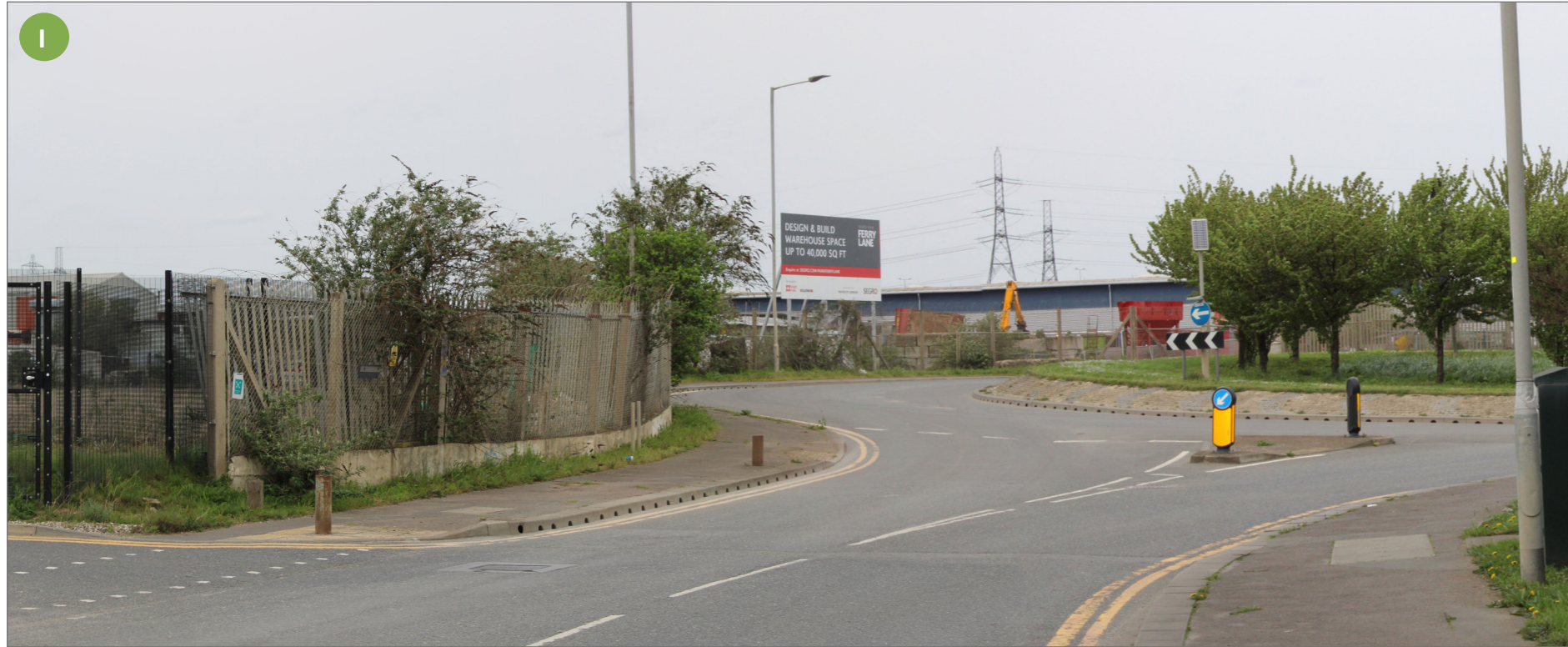
New roundabout and gentrified shed / units with disturbed ground awaiting development.

The Character and Appearance of the Local Area