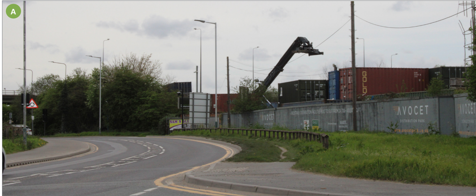
Stacking of containers and a variety of commercial activities.

The Character and Appearance of the Local Area