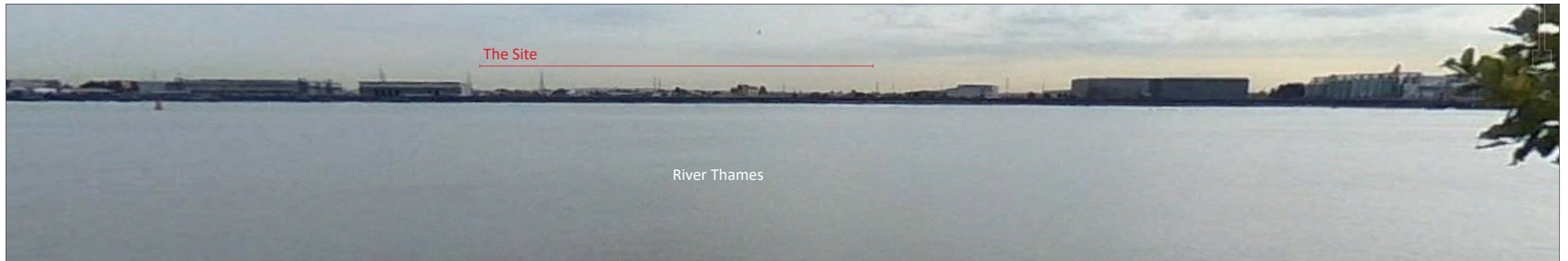
Receptor 15 - Receptors using the Thames Path on southern bank of river, adjacent to Steel Arts Metal Work Limited, at a distance of ~810m from the Site