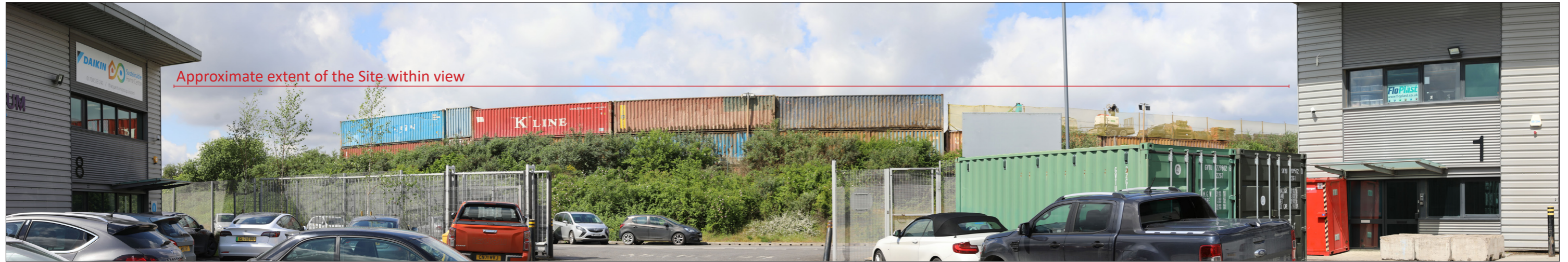
Receptor 13 - Work place receptors in individual / work units off Ferry Lane, located opposite the Site, looking west towards the Site at a distance of ~60m