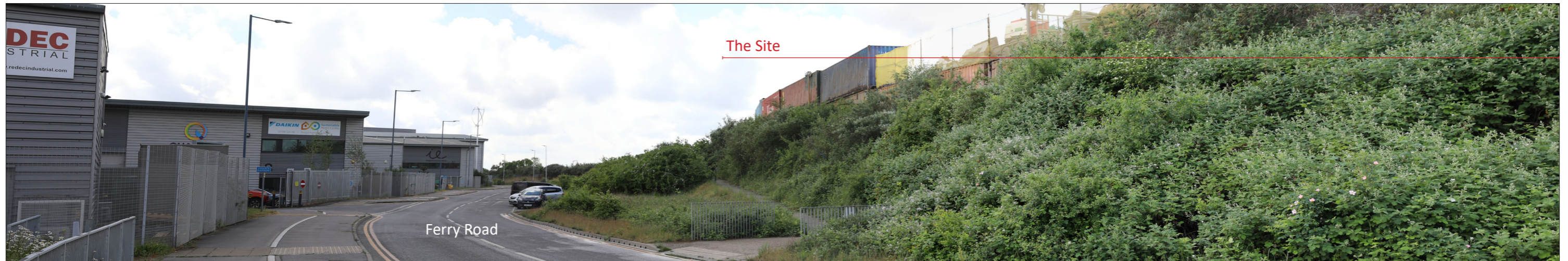
Receptor 14 - Work place receptors located off Ferry Lane located opposite the Site, looking west towards the Site at a distance of ~15m