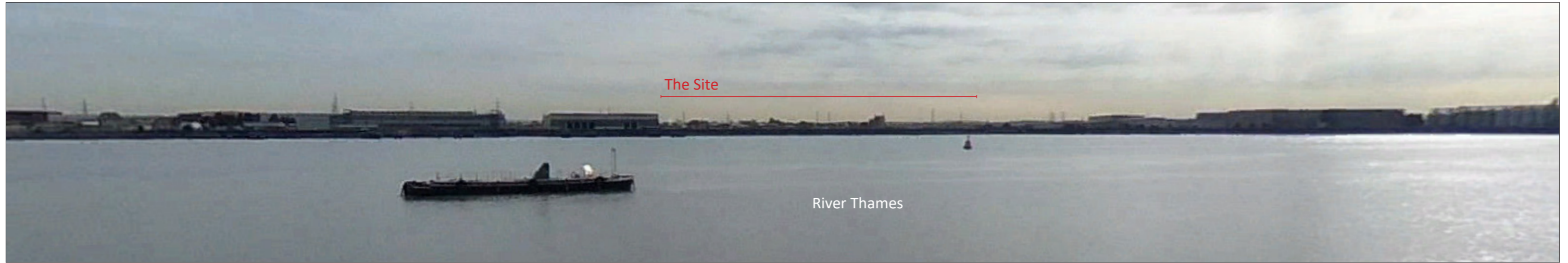
Receptor 16 - Receptors using Thames Path on southern bank of river, adjacent to Belvedere Industrial Estate and Lidl Belvedere Regional Distribution, at a distance of ~785m from the Site