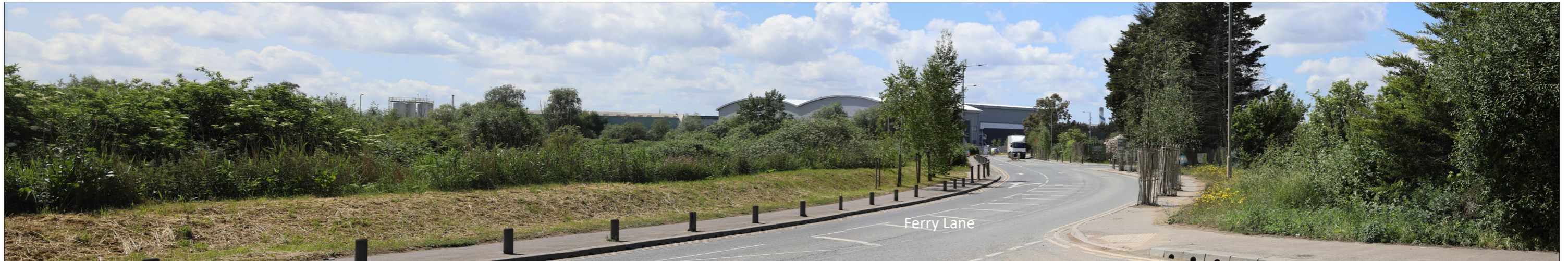
Receptor 5 - Receptors using Ferry Lane / Coldharbour Lane, looking south towards the Site at a distance of ~315m