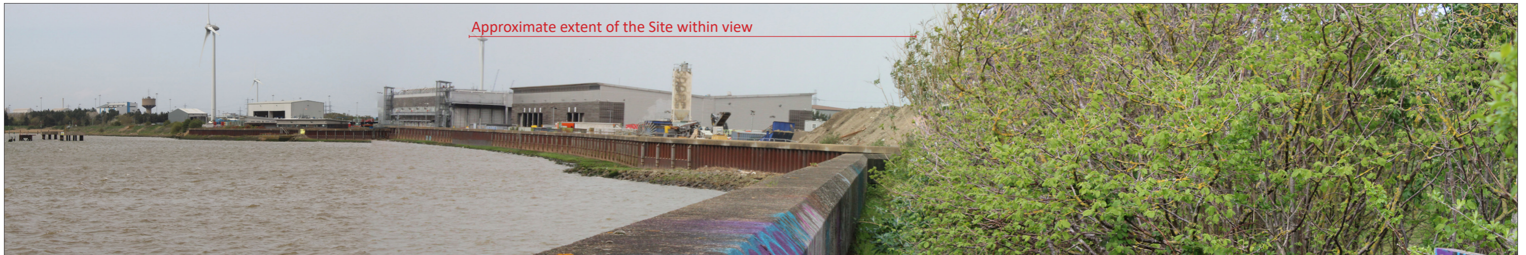
Receptor 11 - Receptors using a section of PROW ref. 266 located immediately south of the Site