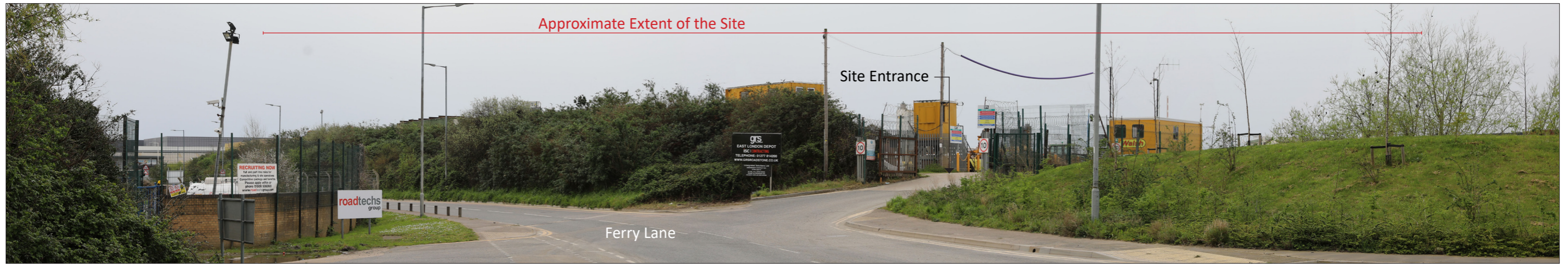
Receptor 1 - Receptors using Ferry Lane looking south east to the Site Entrance from a distance of ~ 70m