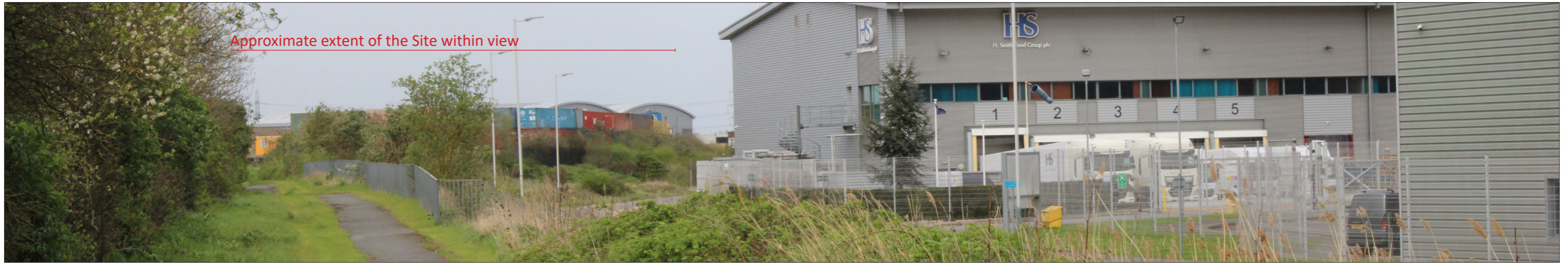
Receptor 10 - Receptors using PROW ref. 266 looking north towards the Site at a distance of ~170m