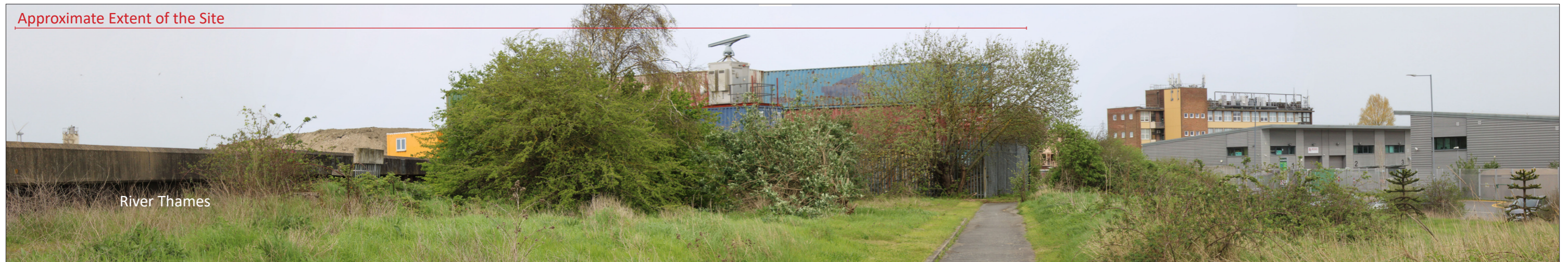
Receptor 9 - Receptors using the Rat Path looking north towards the Site at a distance of ~270m