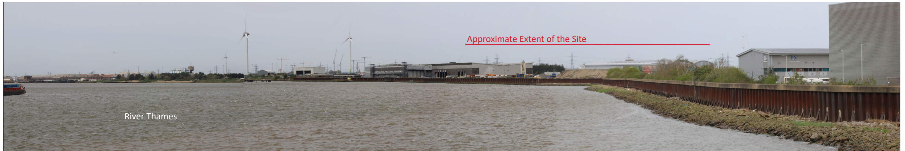
Receptor 8 - Receptors using the Thames Pathway near Tilda Wharfage looking north towards the Site at a distance of ~480m