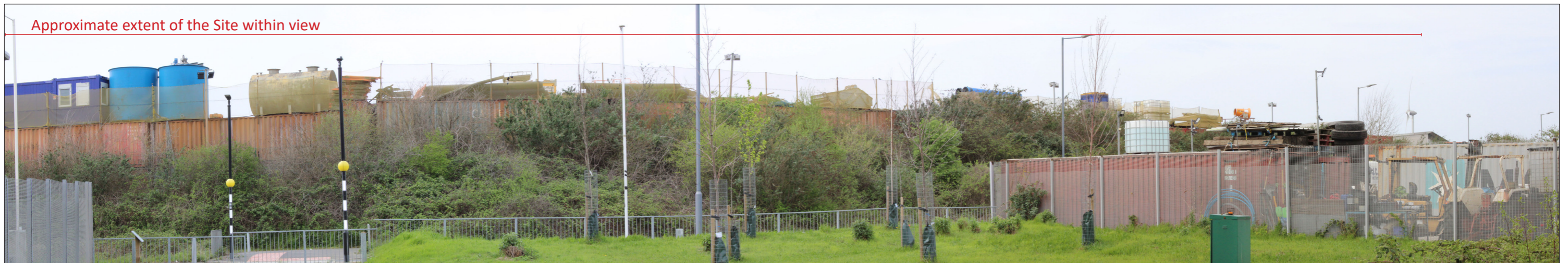
Receptor 12 - Receptors using sections of PROW ref. 266 located in between rear of individual units and Thomas George Johnson building