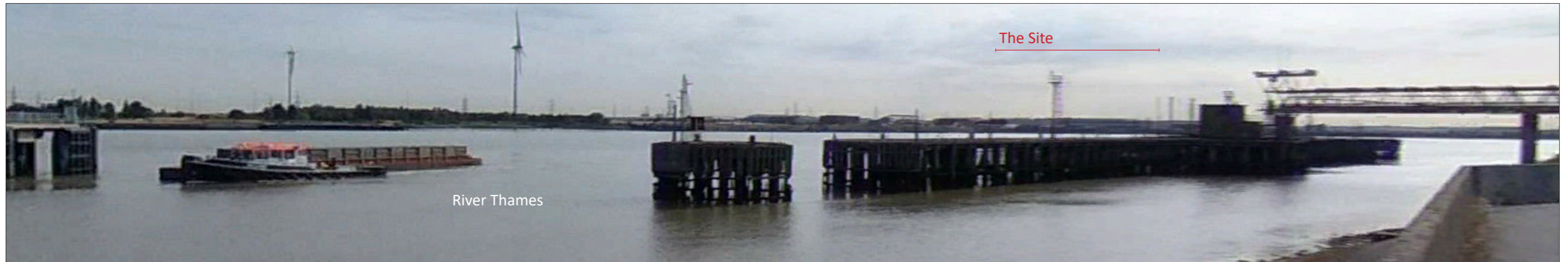
Receptor 17 - Receptors using Thames Path on southern bank of river, adjacent to Riverside Reserve Recovery Ltd / T/A Cory Riverside Energy, at a distance of ~1.3km from the Site