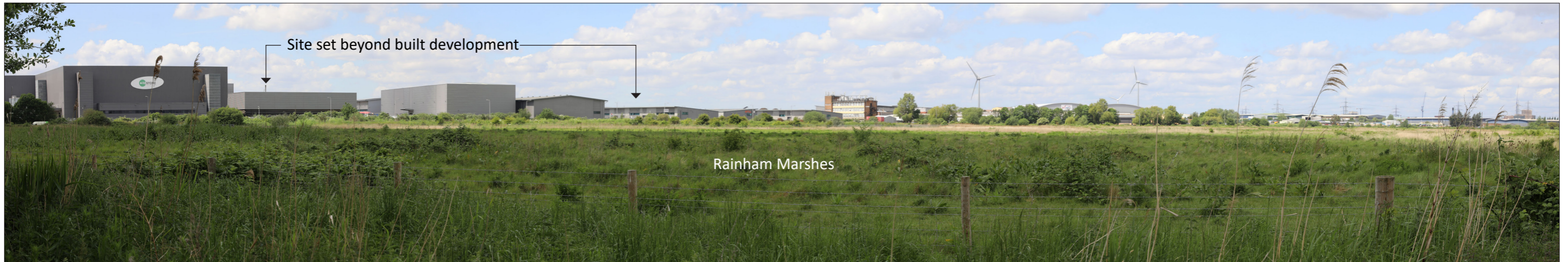
Receptor 6 - Receptors using PROW through Rainham Marshes, looking west towards the Site at a distance of ~645m