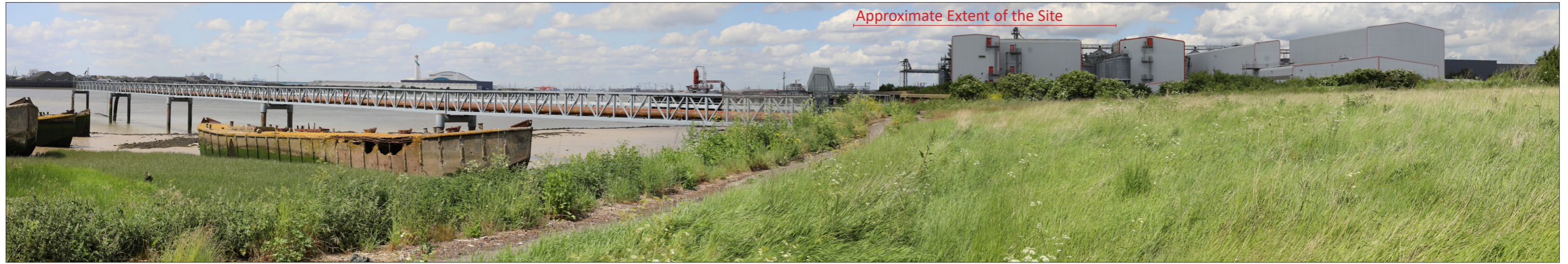
Receptor 7 - Receptors using Public Open Space / PROW around the Riverside Car Park, looking north towards the Site at a distance of ~820m