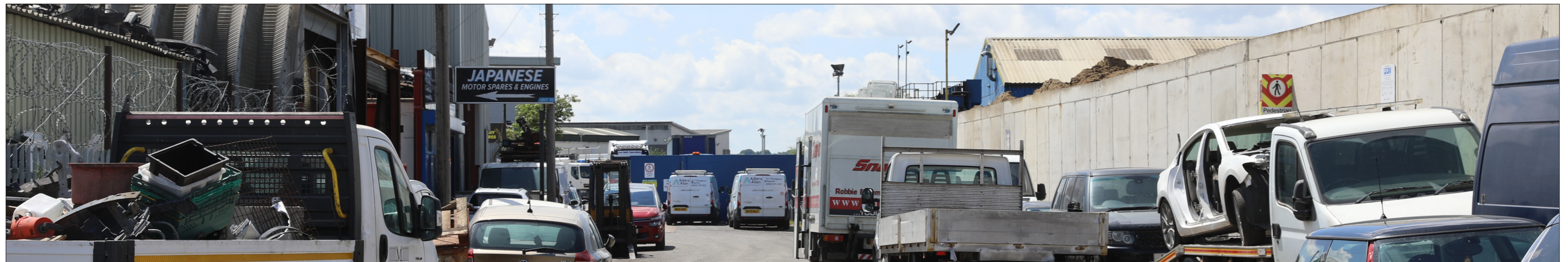
Receptor 3 - Receptors (workers / trading estate) off Salamons Way, looking south towards the Site at a distance of ~ 450m