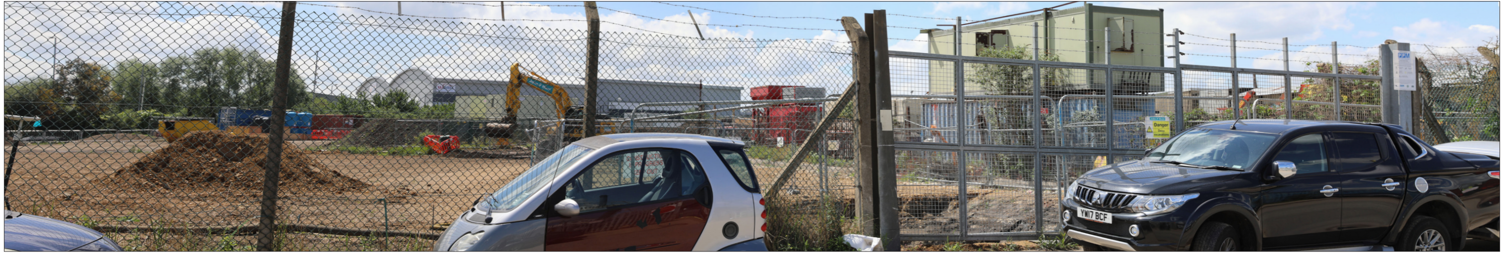
Receptor 4 - Receptors (workers / trading estate) off Salamons Way, looking south towards the Site from a distance of ~450m