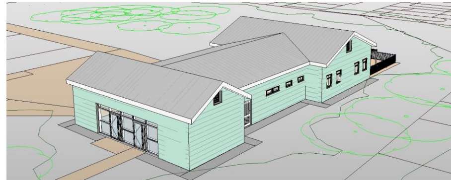
View from above on the glazing wall of the Heart Space toward the Sensory garden