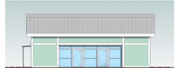
B - North Elevation toward Sensory Garden