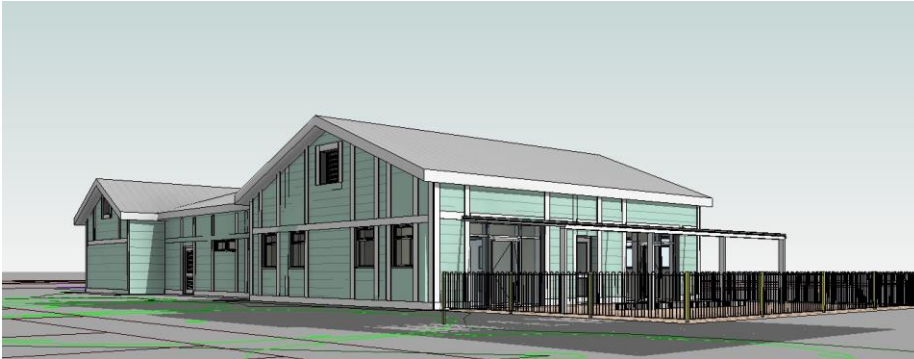
View from boundary line on back of the SEND block