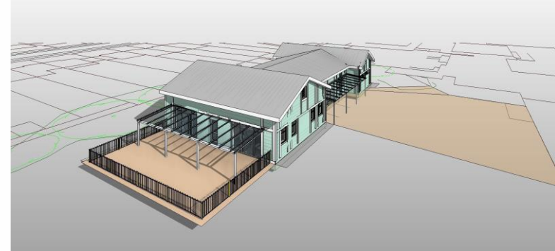
View from above on the playground