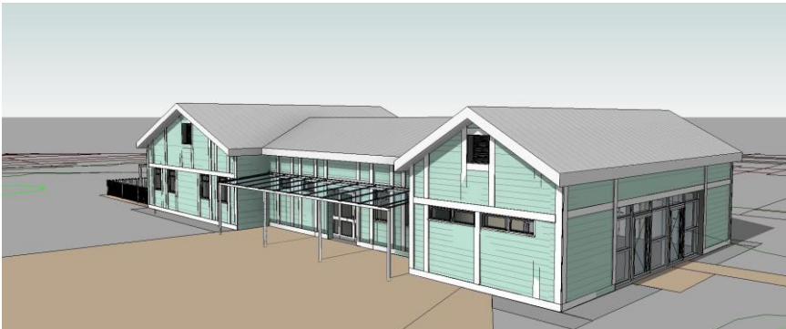
View from the piazza on the SEND Block entrance