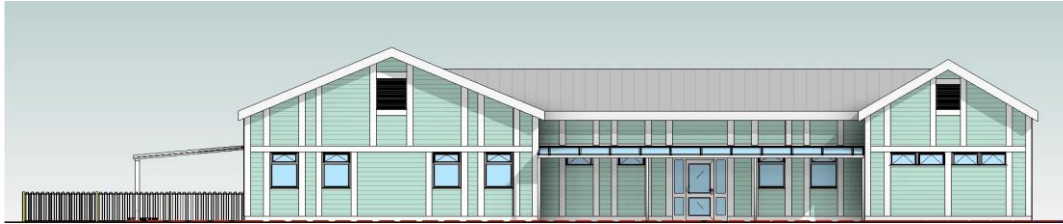
A - East Elevation with main entrance and facing playing field