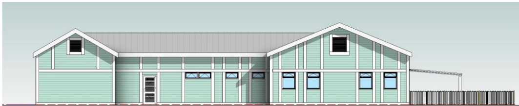
C - West Elevation toward boundary line