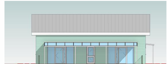
D - South Elevation toward playground